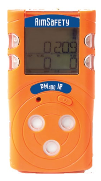
3-1 PM<sub>400</sub> Monitor