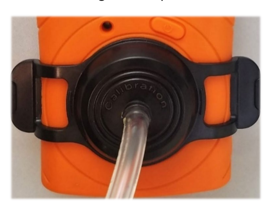
5-1 Calibration Hood

NOTE: Be sure that the word "Calibration" is right-side-up.