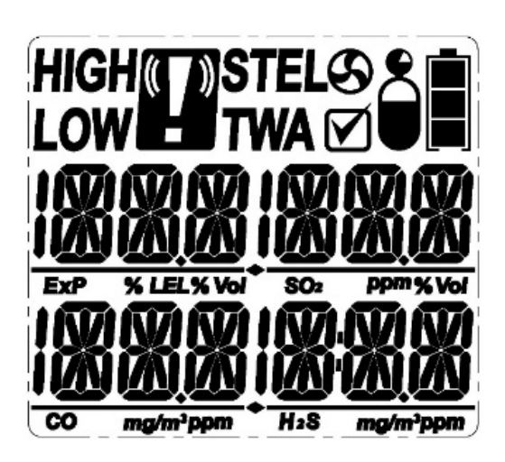
3-2 PM<sub>400</sub> Display Screen