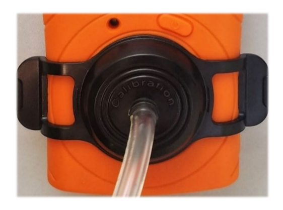
6-1 Calibration Hood

2. Clip the calibration cap to the unit. The cap attaches to the recesses in either side of the unit. You should hear a click when the cap is secure. Be sure you have the cap right-side up when attaching it.