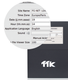
User-friendly interface of configuration