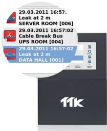
Simultaneous alarms displayed on one screen