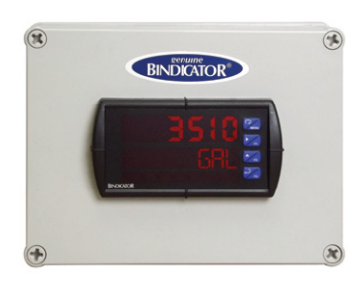
PRD1000 in NEMA 4X Enclosure

The PRD1000 is a power supply and local display meter ideal for level, flow rate, temperature, or pressure transmitter applications. Available in 85-265 VAC or 12-24 VDC with up to two relays. It has a dual-line 6-digit display, advanced signal input conditioning, function keys, and Modbus RTU serial communications. The basic model includes an isolated 24 VDC transmitter power supply that can be used to power the input transmitter or other devices. A NEMA 4X enclosure is optional, as well as, an RS-485 serial adapter.